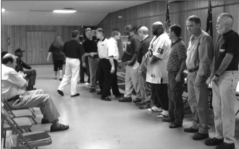
Officers and representatives being sworn in their new leadership positions.