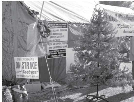
Christmas spirit on the picket line

In the background there are many things going on. There are picket lines to be maintained with food, wood and other supplies. There are volunteers working daily at the union hall. There is almost never a dull moment, at the local, as people and activities buzz around all day long.